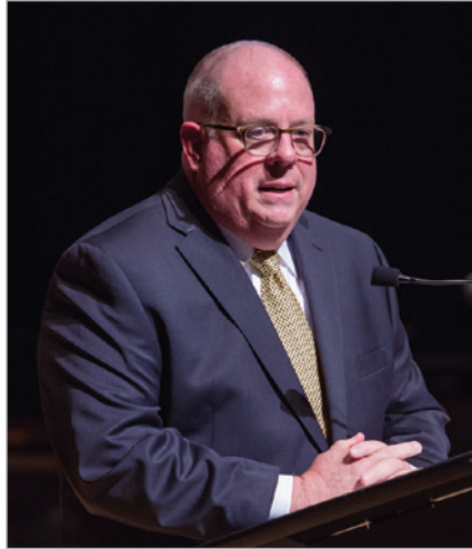
Governor Larry Hogan recognizes Ike Leggett's many contributions to Montgomery County.