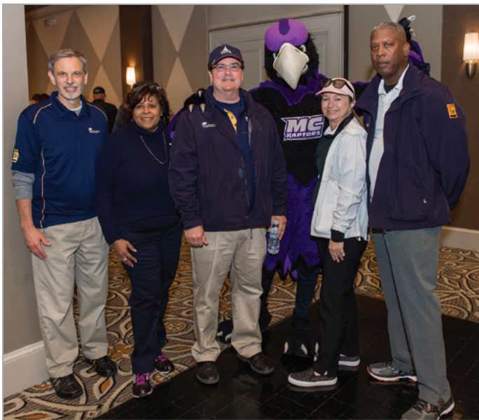
Educational Systems Federal Credit Union representatives and the Raptor.